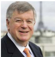
Didier Lombard France Télécom Orange Chief Executive Officer

“We are happy to take part in this new march of the “Alerte Enlèvement”- plan and to be contributing to its expansion for web and mobile phones. As a global telecommunication operator, this commitment is central to the company’s responsibility. We therefore hope that a larger part of the population will be informed in case of alert, and that the system’s efficiency will be increased- although its effectiveness has already been demonstrated. Orange will also relay the alerts on its TV network, in particular through channels and services the company produces.”