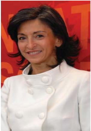
Nicole Guedj Former Minister President of the Red Helmets

“ In 2009, the Red Helmets intend on innovating to promote more and more performing solutions for victims.